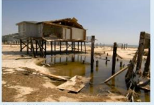
Hurricane Katrina's storm surge destroyed homes and roads on Dauphin Island in 2005.

Whether or not storms become more intense, coastal homes and infrastructure will flood more often as sea level rises, because storm surges will become higher as well. Rising sea level is likely to increase flood insurance rates, while more frequent storms could increase the deductible for wind damage in homeowner insurance policies. Many cities, roads, railways, ports, airports, and oil and gas facilities along the Gulf Coast are vulnerable to the combined impacts of storms and sea level rise. People may move from vulnerable coastal communities and stress the infrastructure of the communities that receive them.